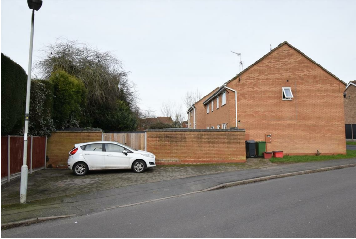
Side driveway parking with gated entry to the rear garden.