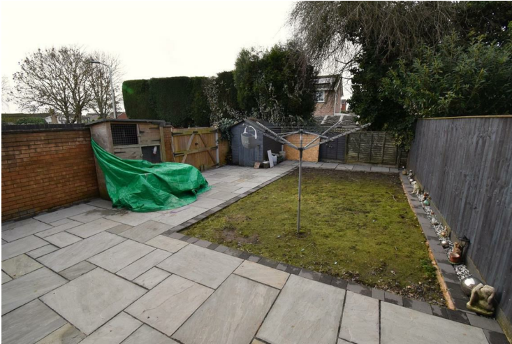
Enclosed rear lawn and patio garden with fencing to the boundary.