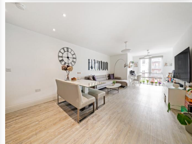
18 Exclusive House, Oldfield Road, Maidenhead SL6 1NQ