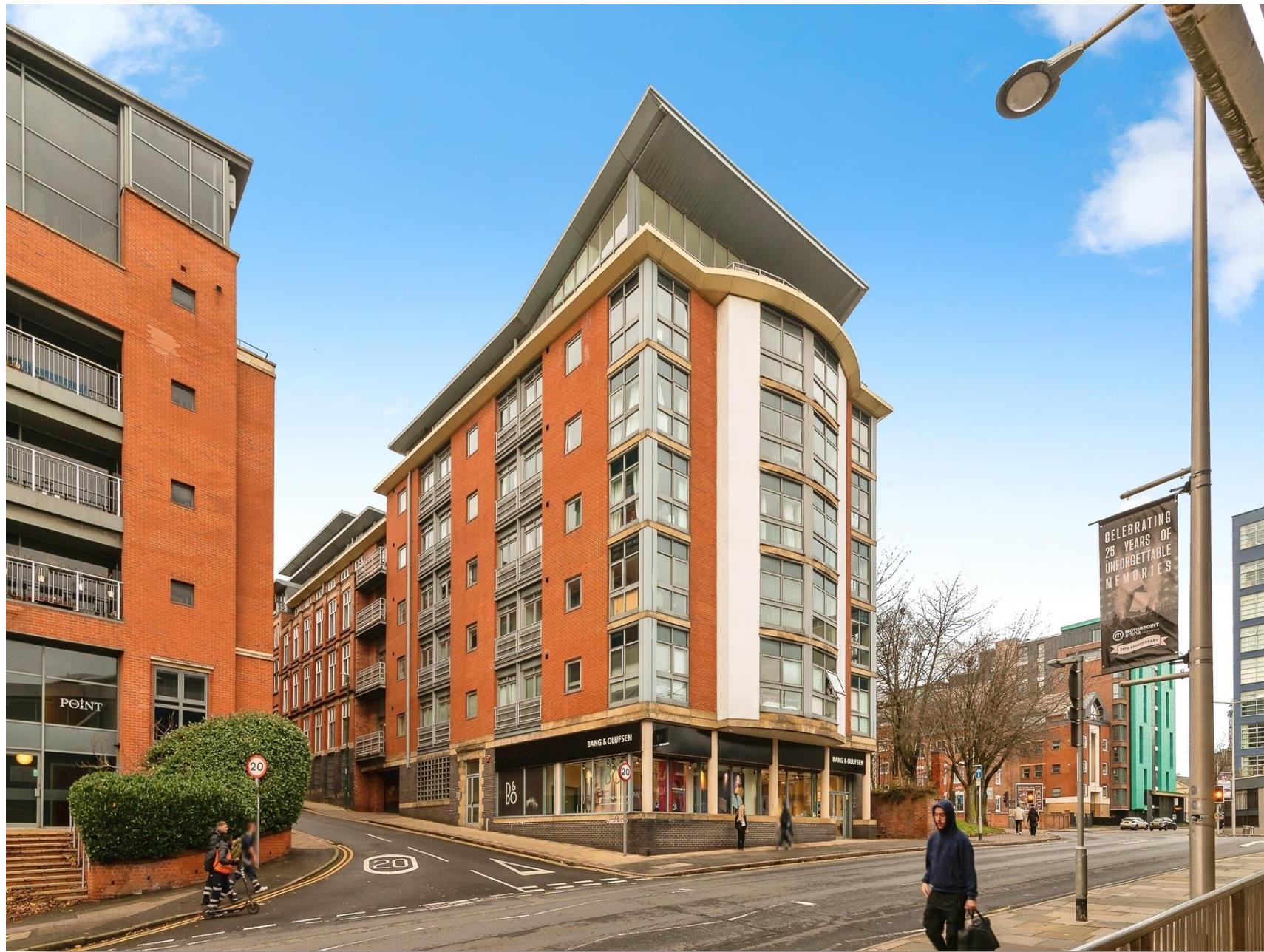
Lexington Place Plumptre Street, Nottingham NG1 1AN