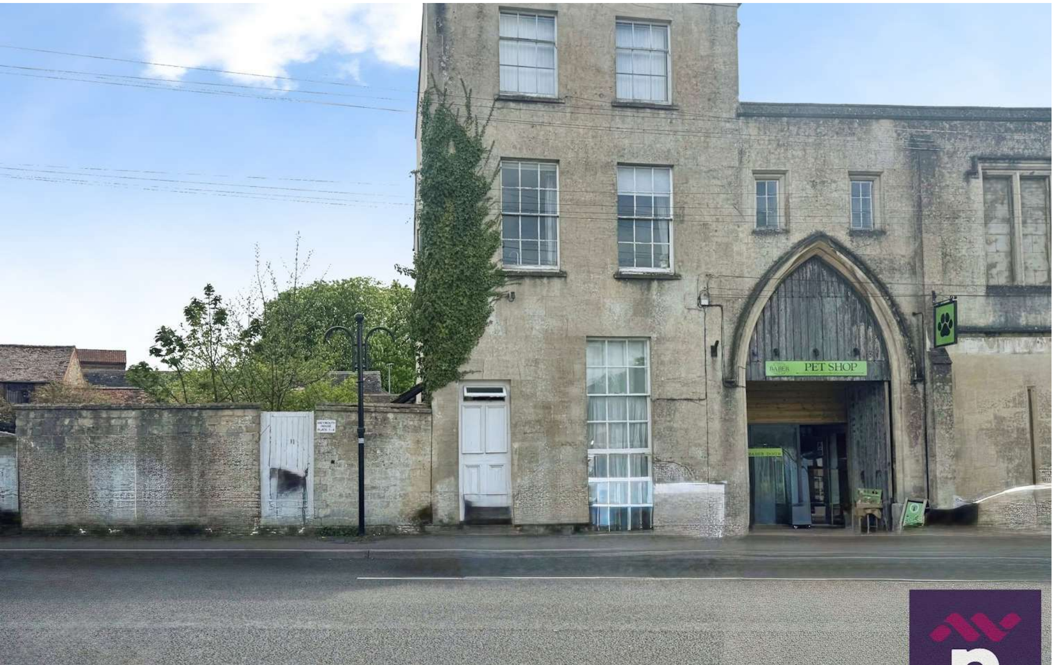
Weymouth Street, Warminster