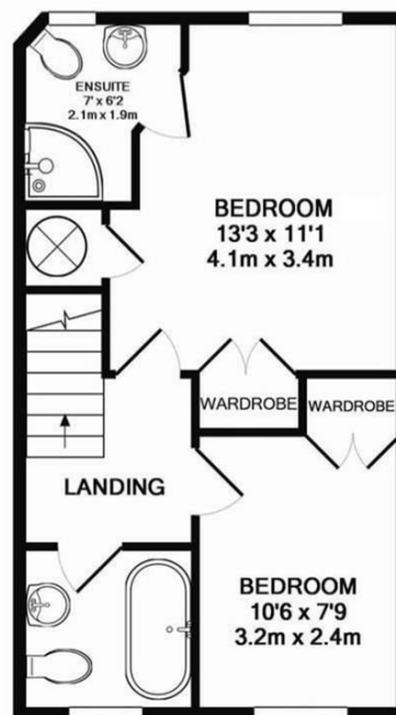
1ST FLOOR APPROX. FLOOR AREA 371 SQ.FT. (34.4 SQ.M.)

TOTAL APPROX. FLOOR AREA 742 SQ.FT. (68.9 SQ.M.)