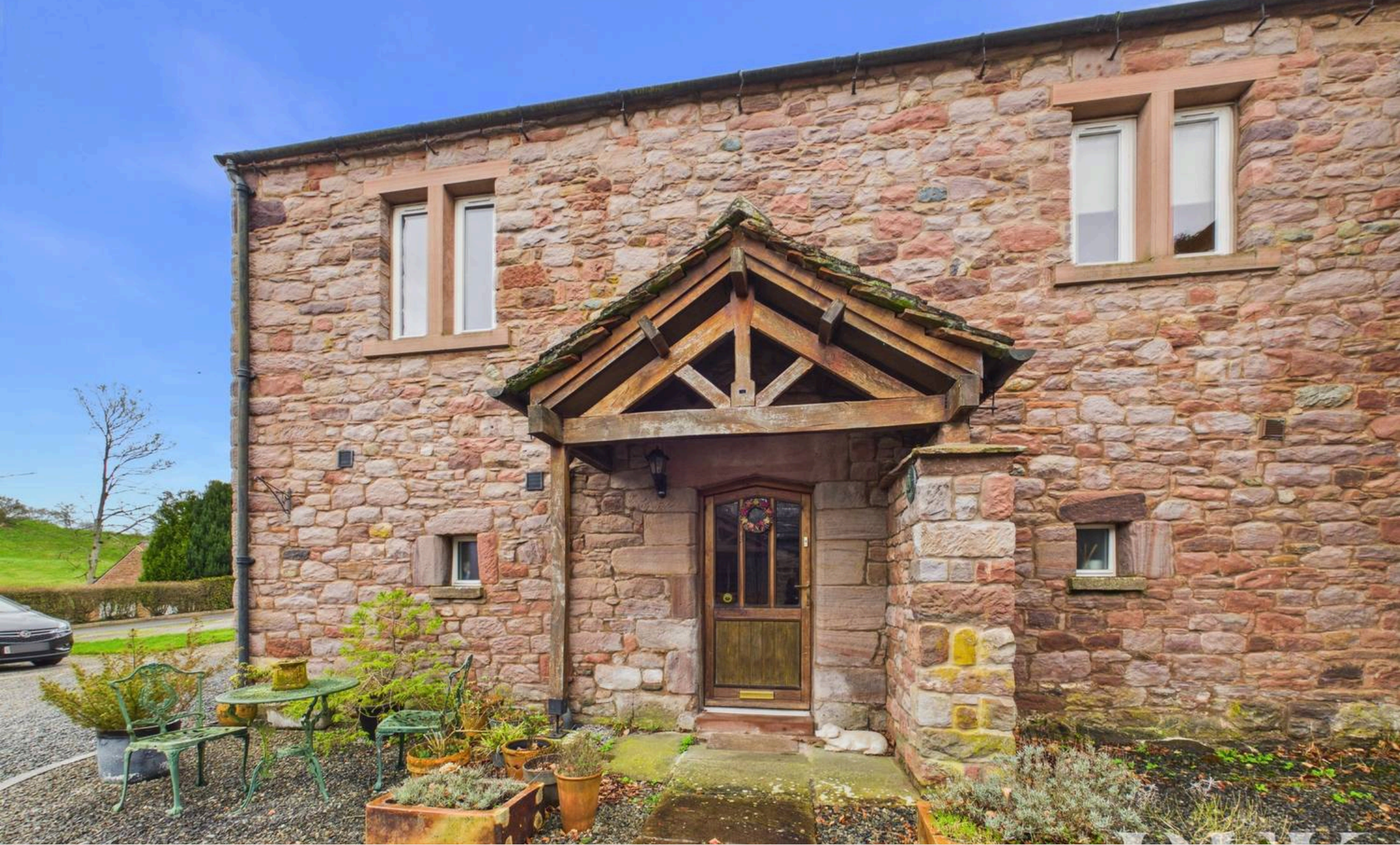
The Stable, 5 The Grange, Ivegill, CA4 0PE. Guide Price £230,000