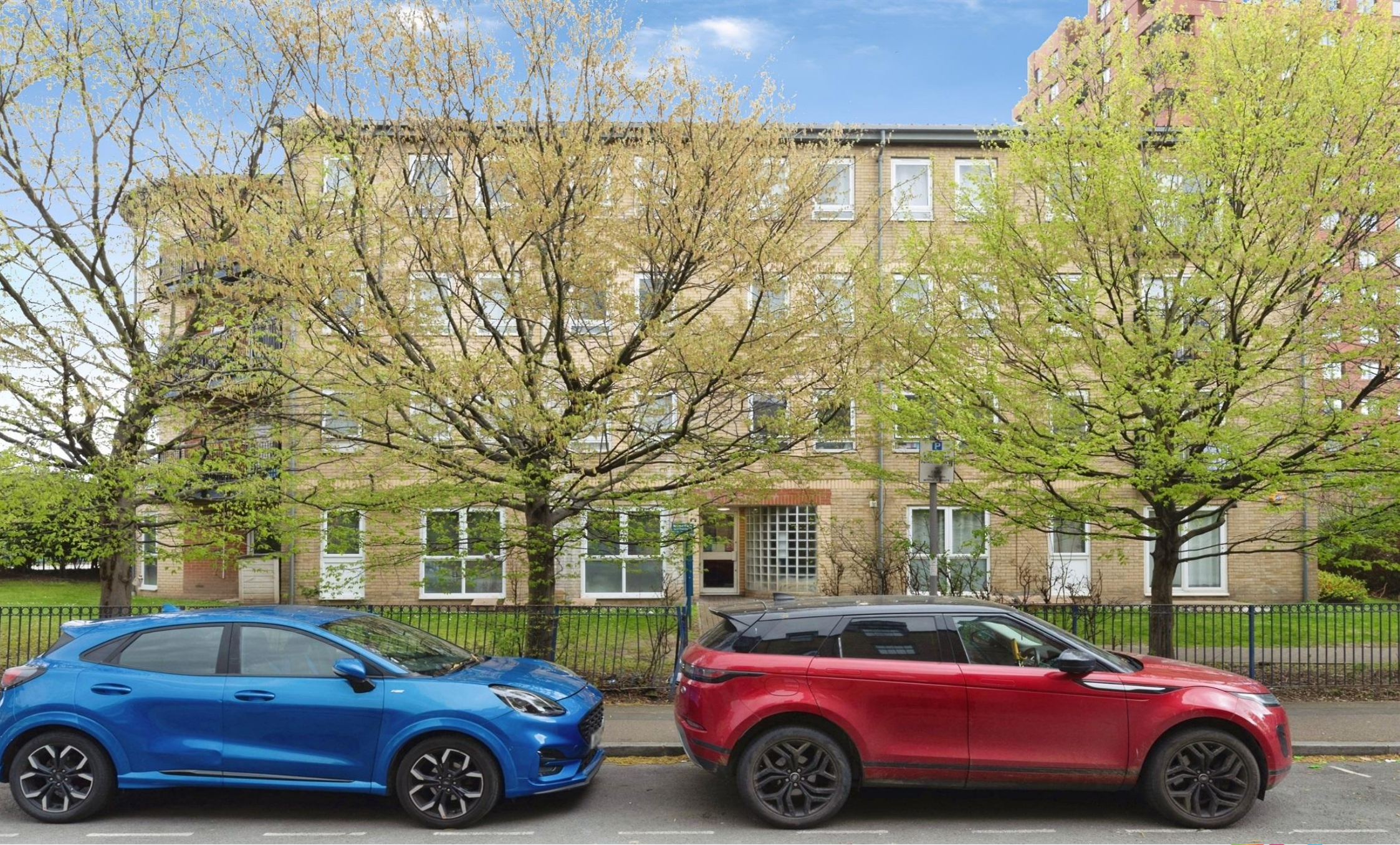
Skipper Court, Abbey Road, Barking, IG11 7GW