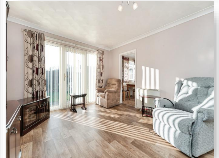
Orchard Close, Manea PE15 0JW