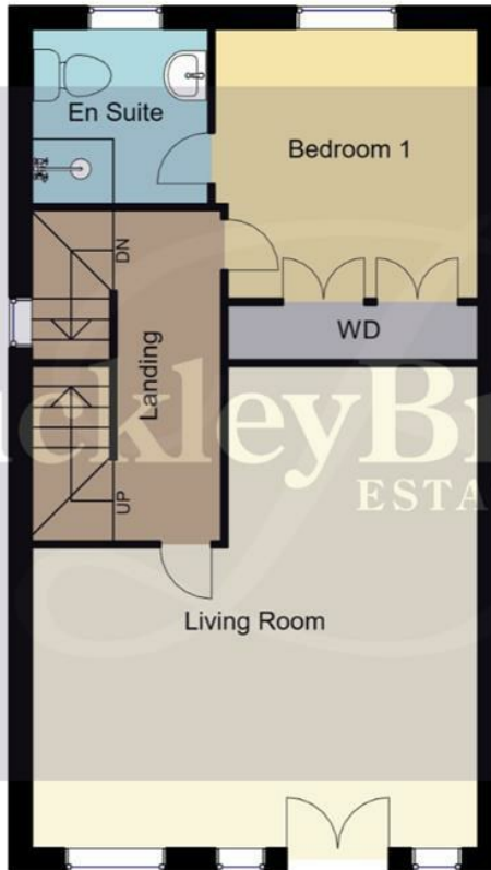
First Floor 41sq.m/439.96sq.ft Approx