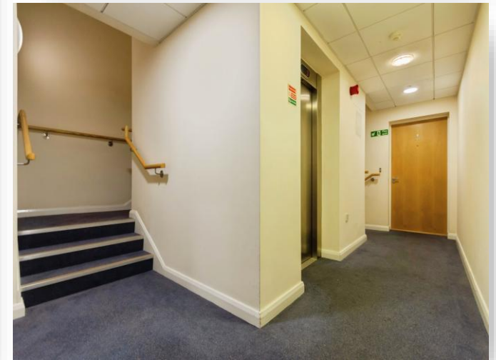
Lock House Waterside, Shirley Solihull B90 1UD