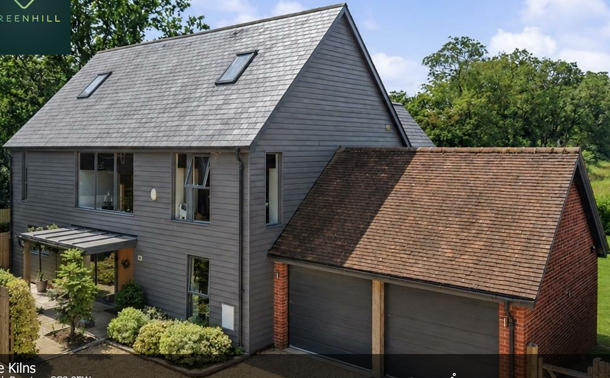
The Kilns Reed, Royston, SG8 8EW Guide price £1,100,000