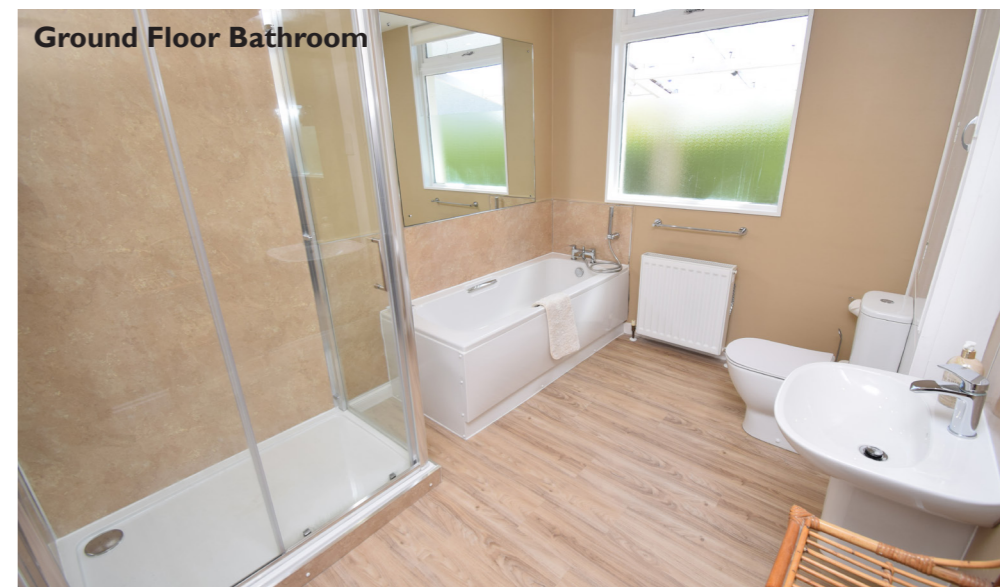
Ground Floor Bathroom