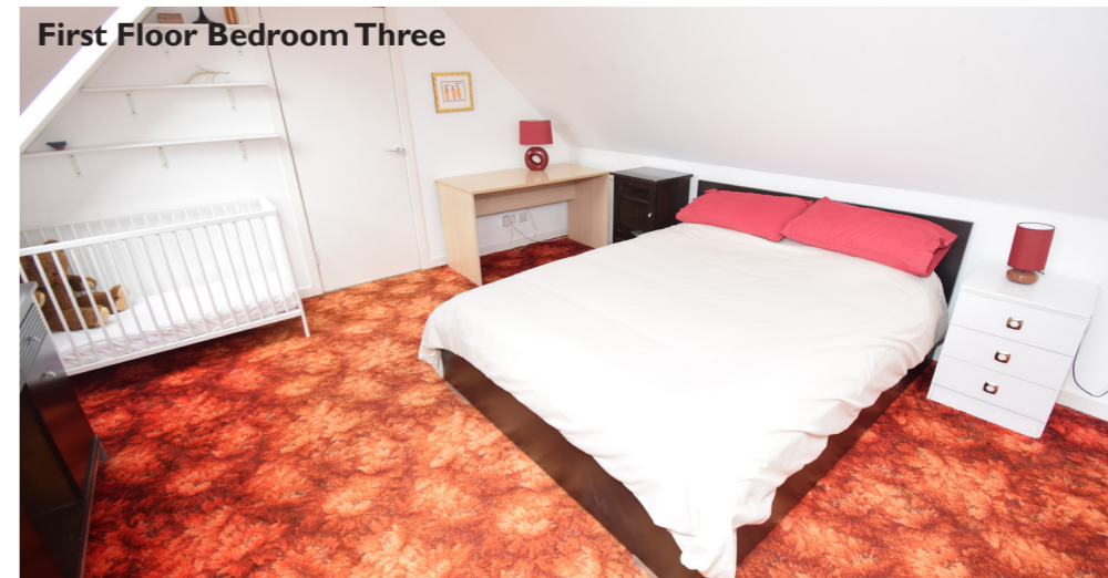
First Floor Bedroom Three