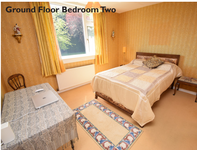
Ground Floor Bedroom Two