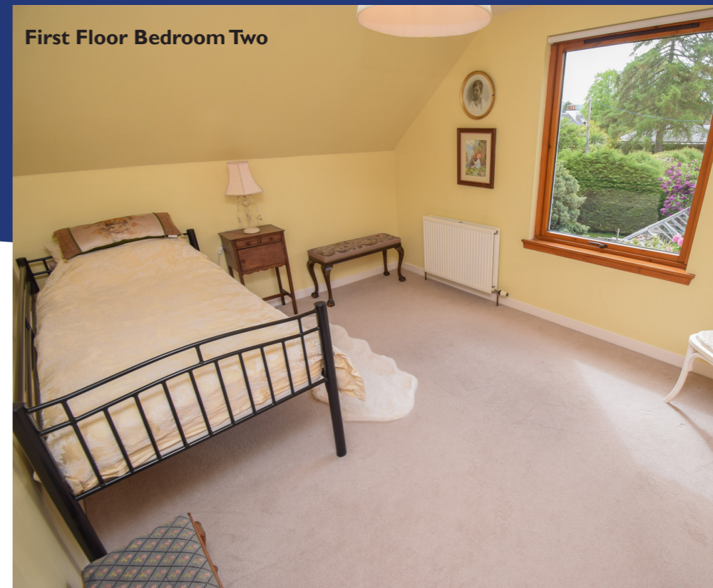
First Floor Bedroom Two