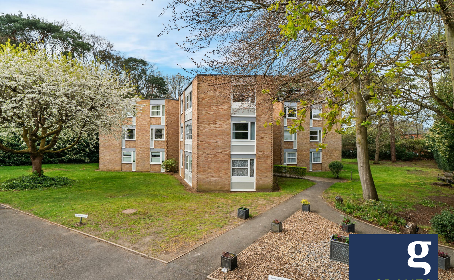
Heathside, Weybridge, KT13 9YL