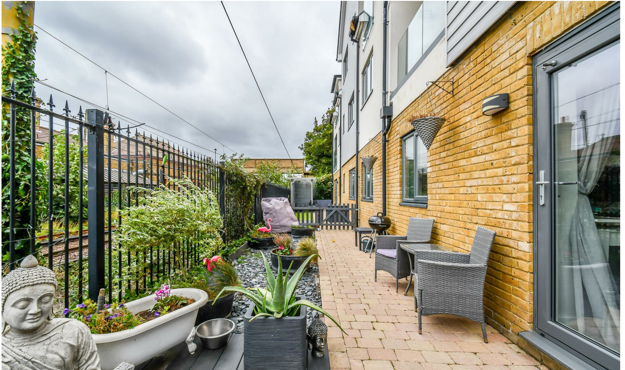
Bell Sands, Leigh-On-Sea £425,000