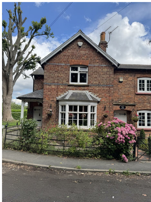
PHOTO TAKEN BY THE VENDOR DURING THE SUMMER

PLEASE NOTE THESE ARE DRAFT PARTICULARS AWAITING FINAL APPROVAL FROM THE VENDOR, THEREFORE THE CONTENTS HEREIN MAY BE SUBJECT TO CHANGE AND MUST NOT BE RELIED UPON AS AN ENTIRELY ACCURATE DESCRIPTION OF THE PROPERTY.