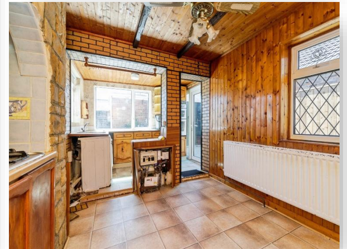
Braemar Road, Billingham TS23 2AD