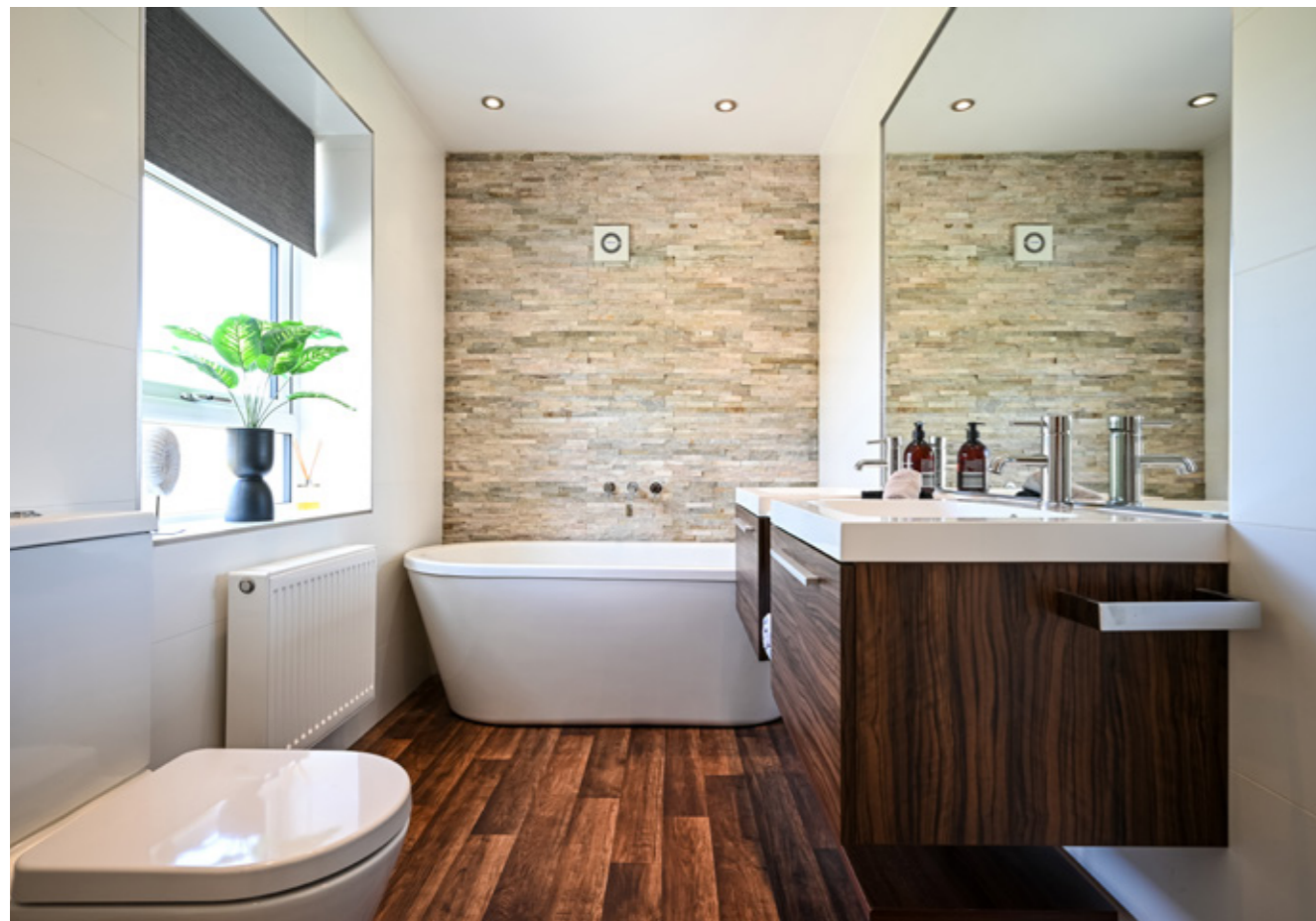
MASTER EN-SUITE BATHROOM