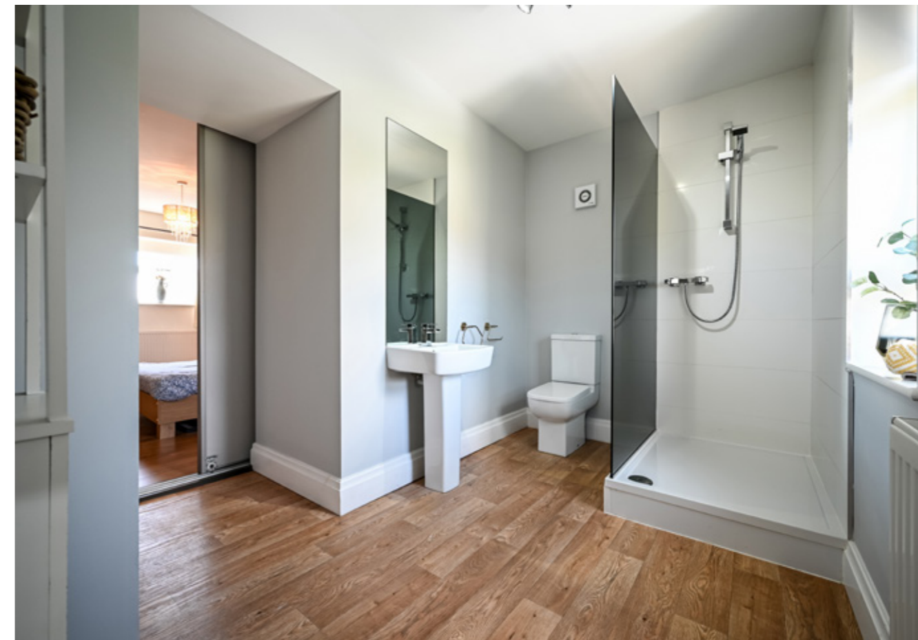
BEDROOM 2/3 EN-SUITE SHOWER ROOM