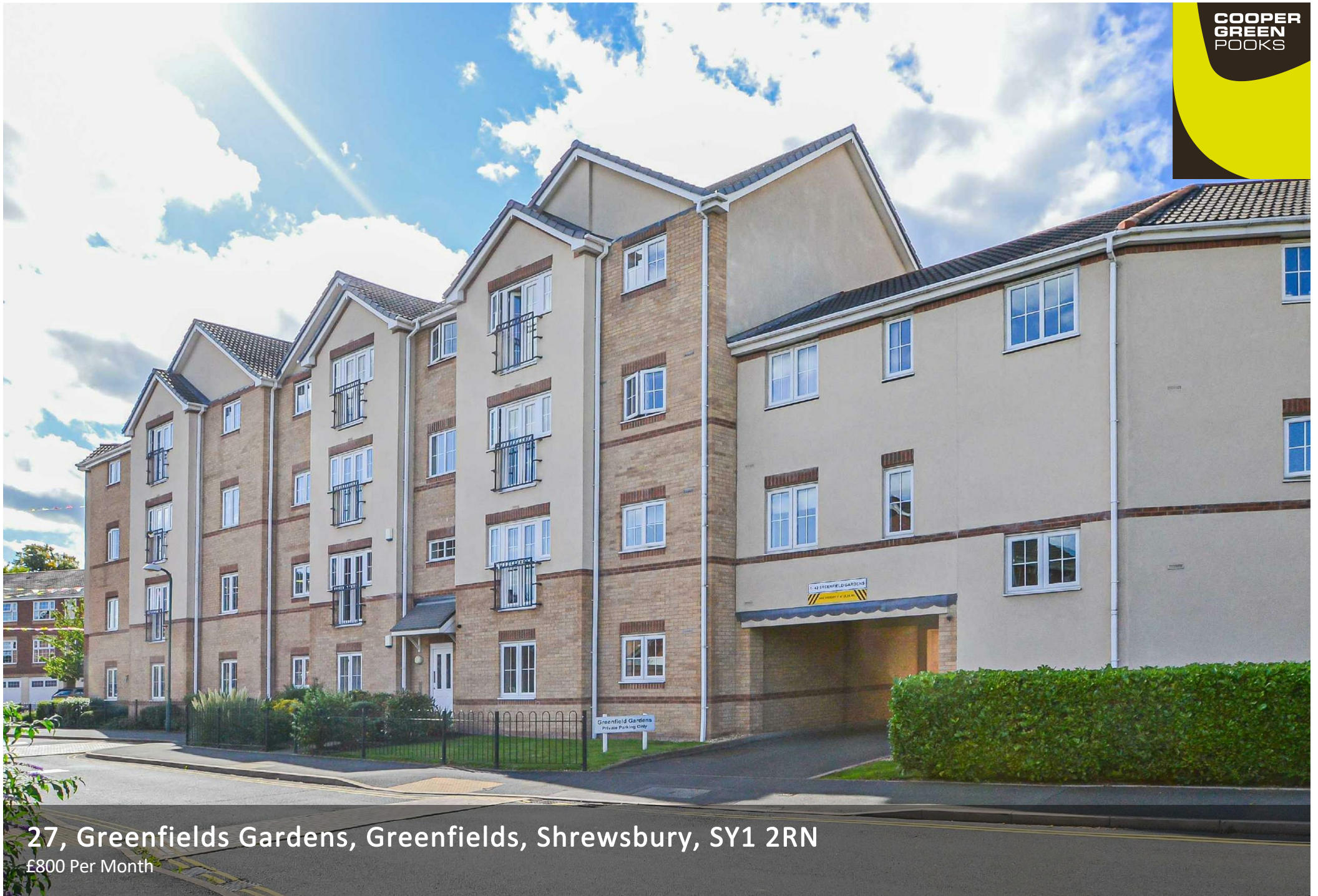
27, Greenfields Gardens, Greenfields, Shrewsbury, SY1 2RN £800 Per Month