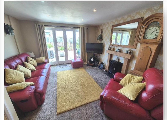
Lorna Doone, West Street, Watchet, TA23 0FD