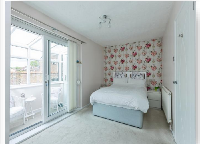
Laithwaite Close, Leicester LE4 1BX