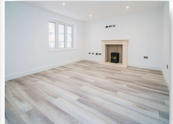
Walnut Tree Close, Nazeing Waltham Abbey EN9 2RJ