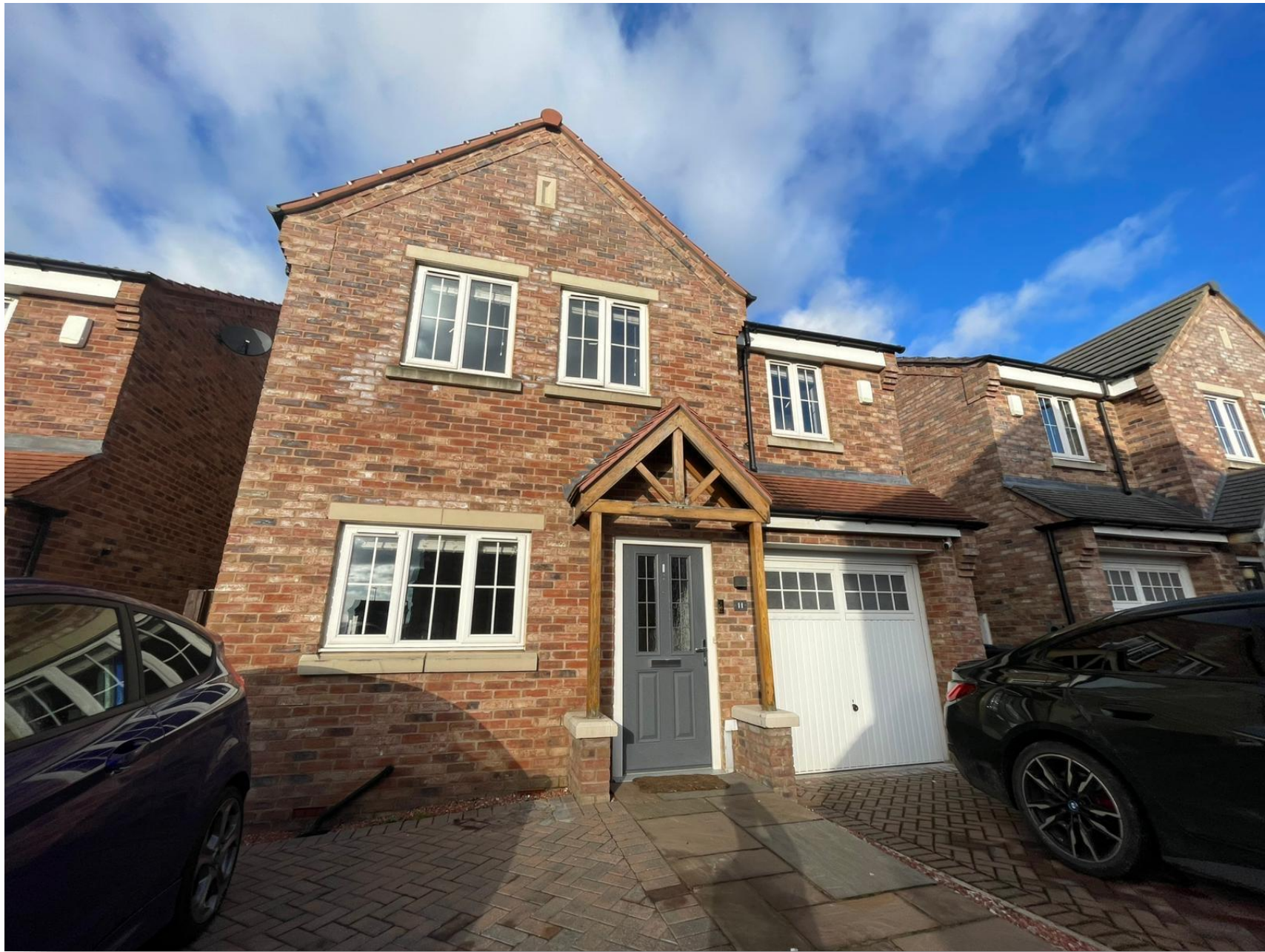
Cherwell Croft, Hambleton Selby YO8 9QQ