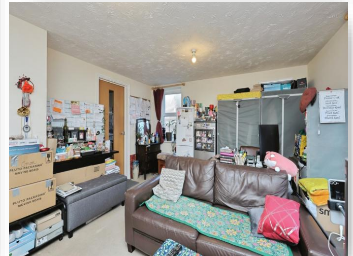
Caddow Road, Norwich, NR5 9PQ