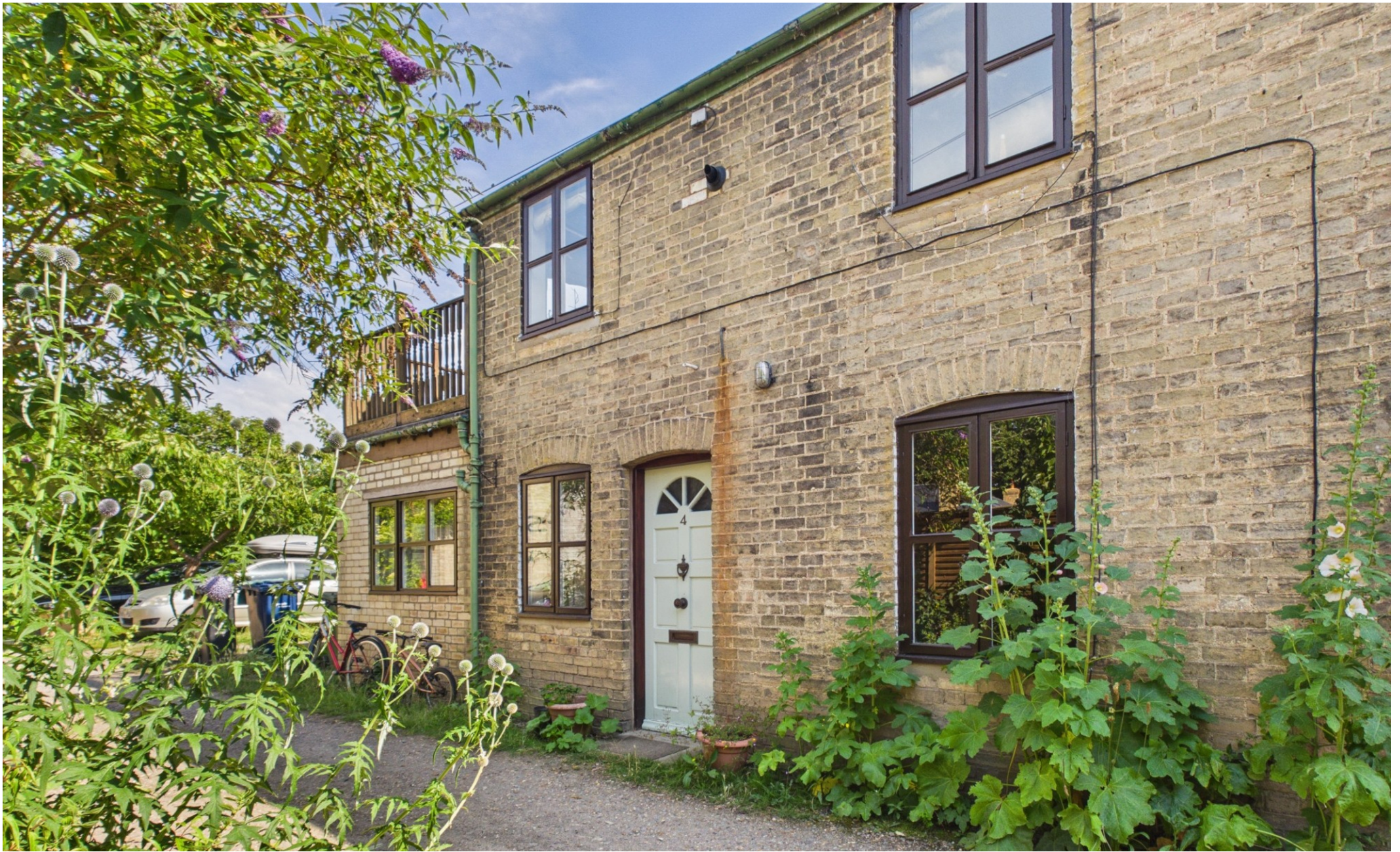
North Cottages, Trumpington Road, Cambridge CB2 8EZ