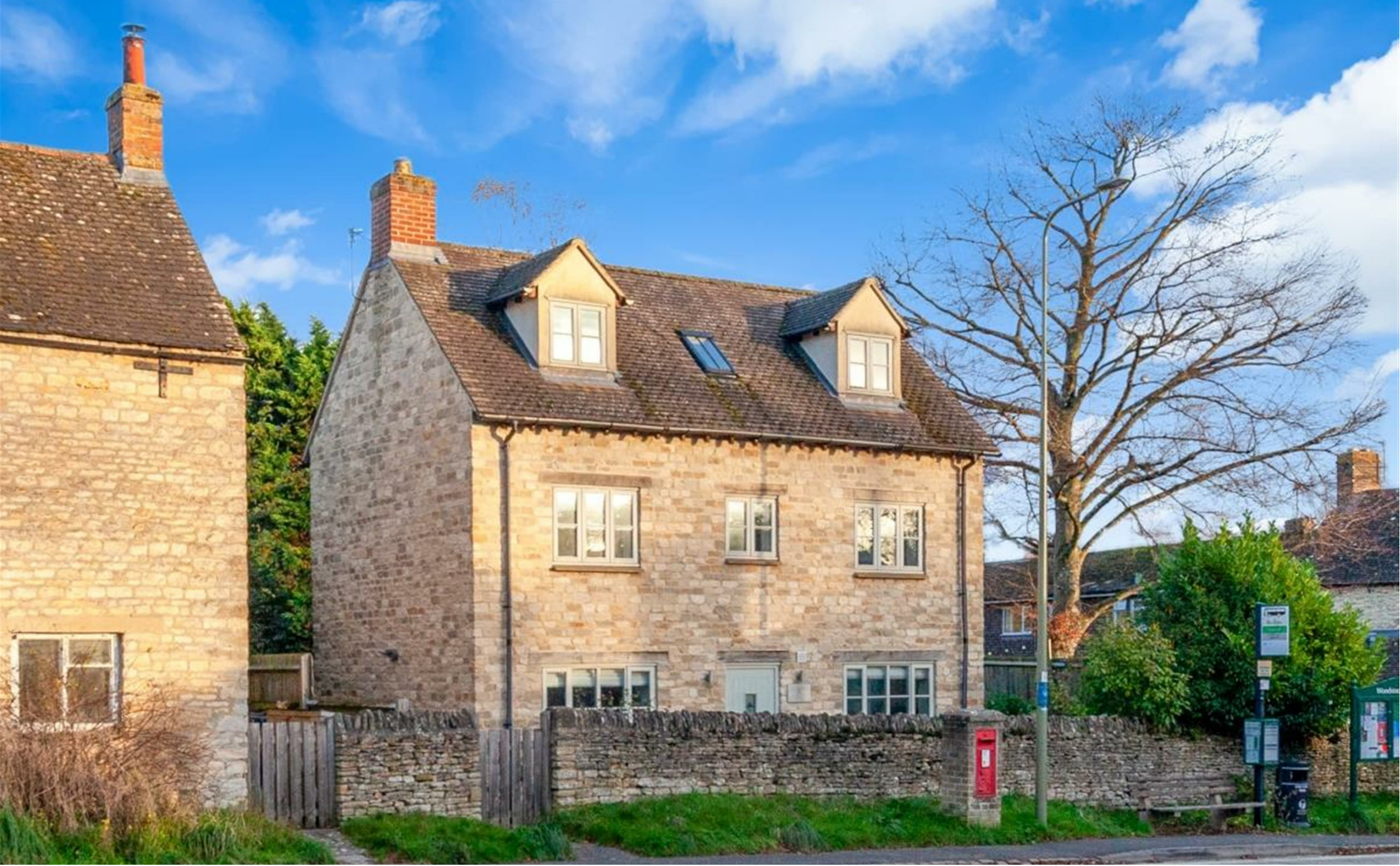
BEECH TREE HOUSE, 86 MANOR RD, WOODSTOCK, OX20 1XL