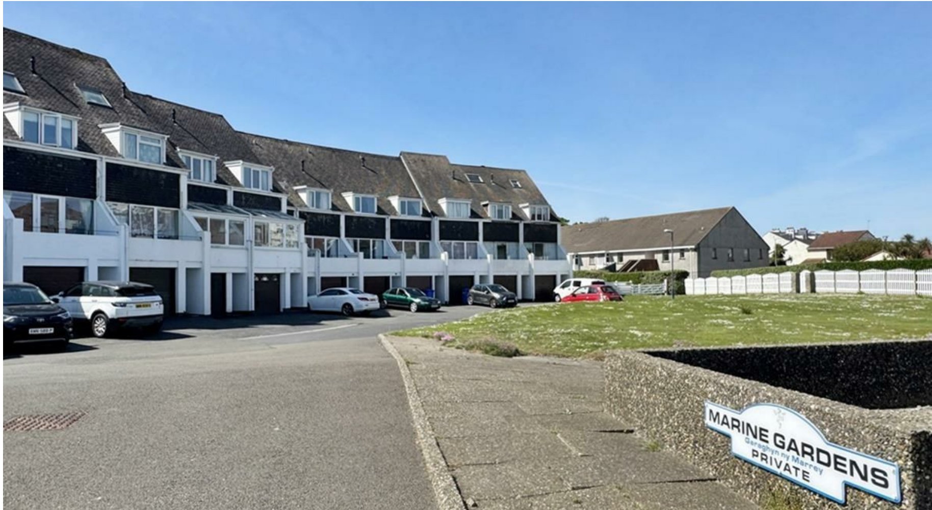
9 Marine Gardens, Ramsey, Isle Of Man, IM8 1EN Asking Price £310,000