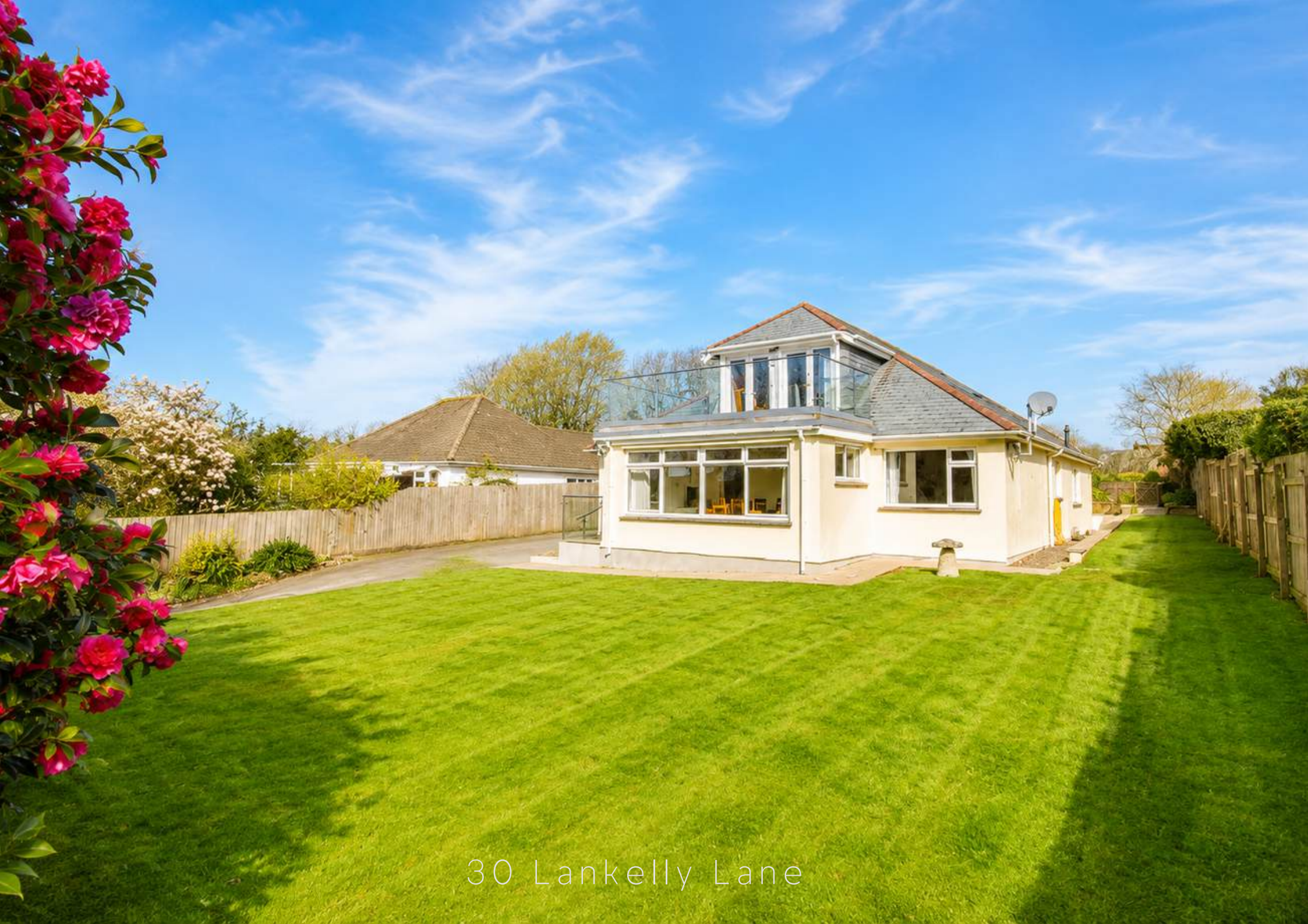
30 Lankelly Lane