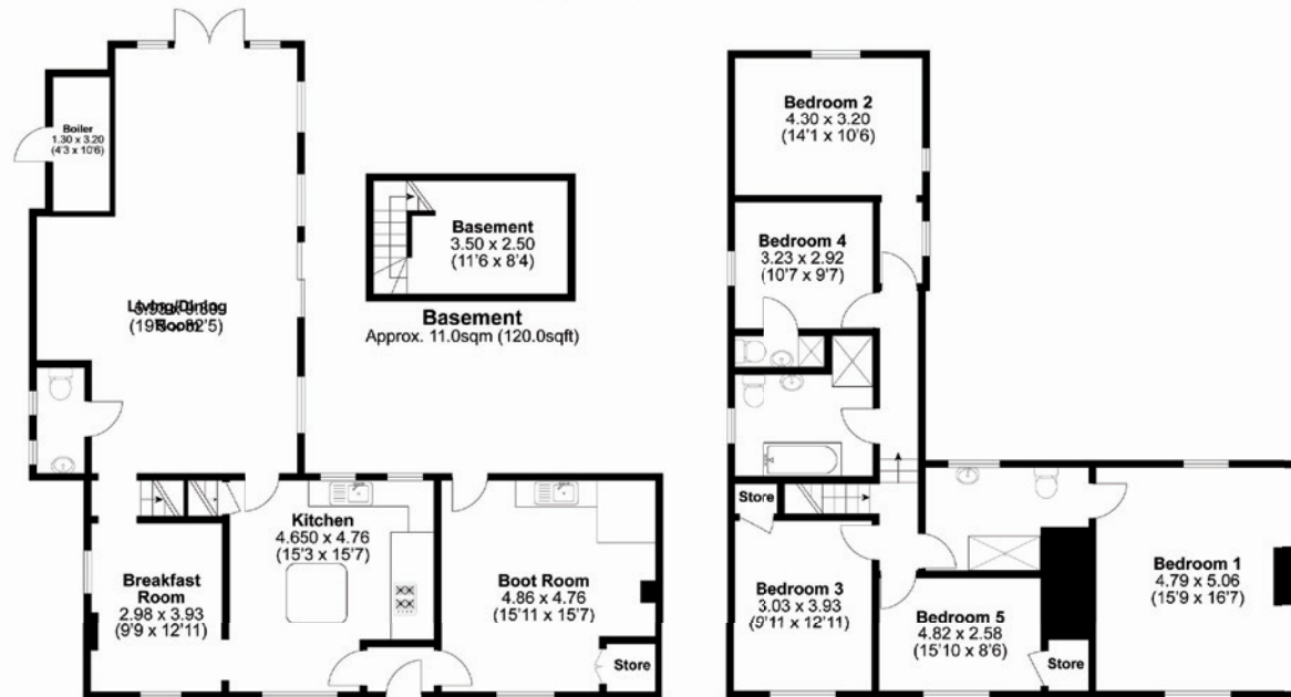
Ground Floor Approx. 119.0sqm (1285.0sqft)