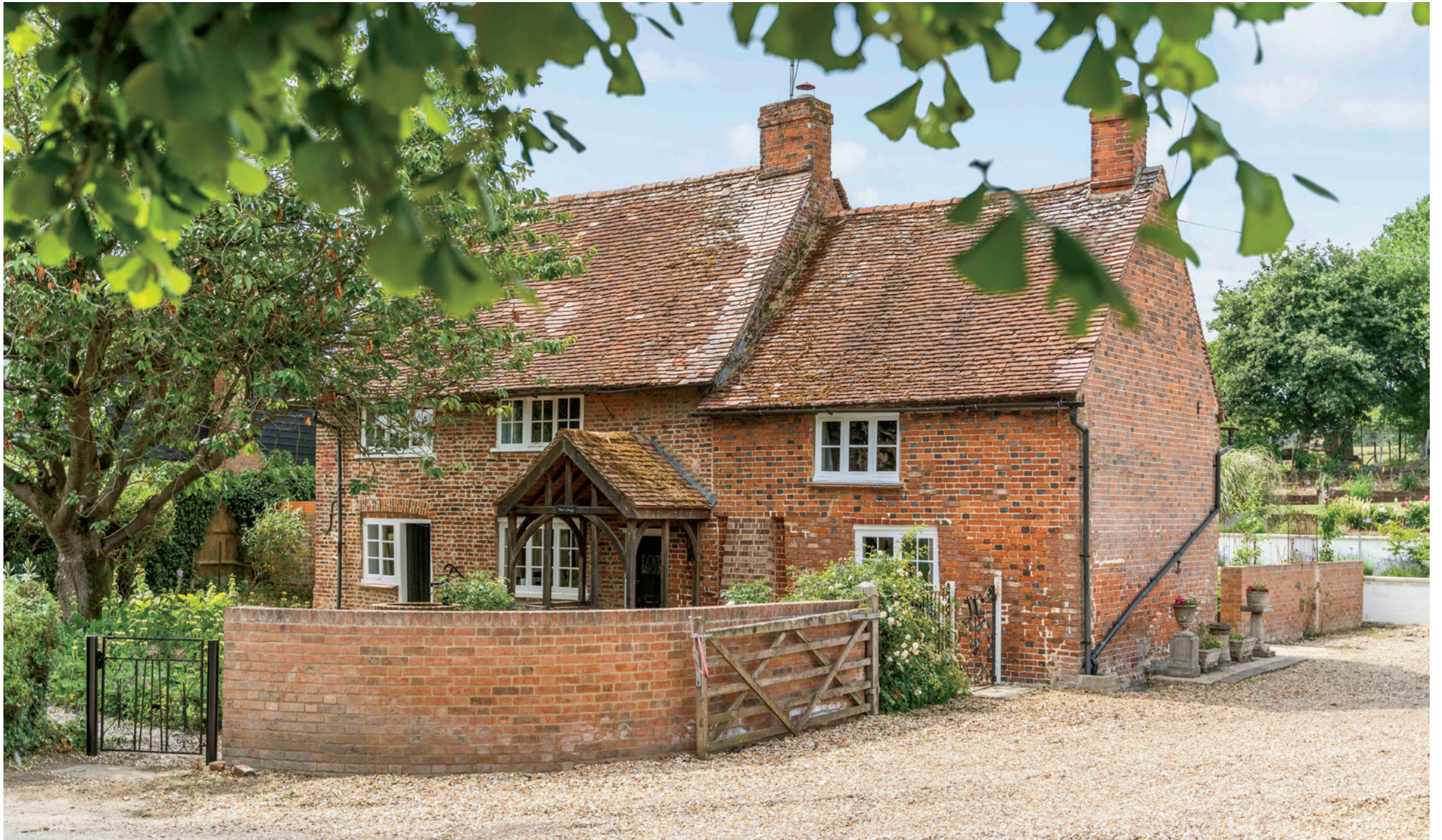
The Cottage, Little Dassels Farmhouse Dassels | Braughing | Hertfordshire | SG11 2RP