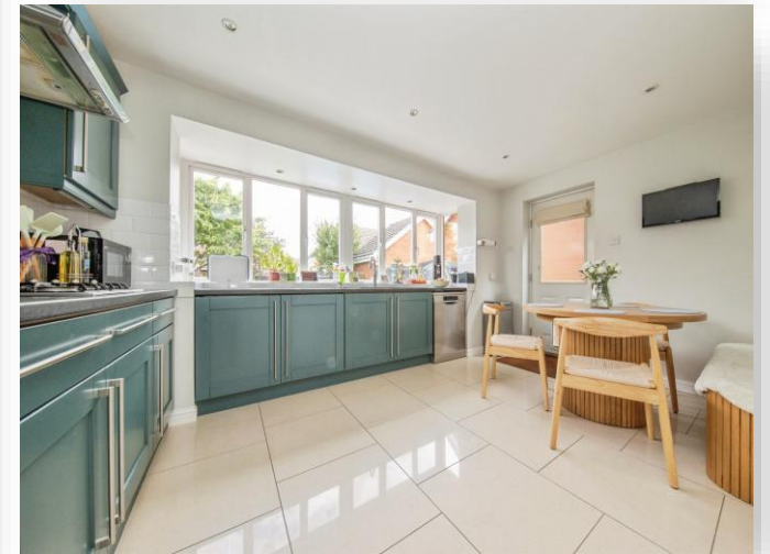
Bentley Road, Ipswich, IP1 5QA