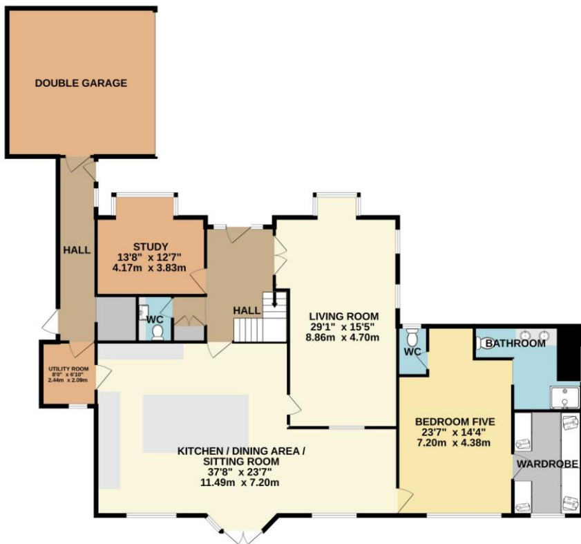
GROUND FLOOR 2477 sq.ft. (230.1 sq.m.) approx.