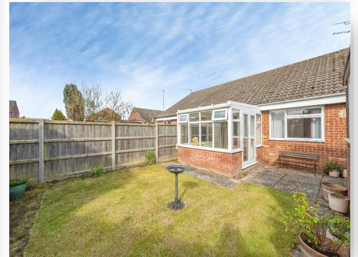
Legrice Crescent, North Walsham NR28 9AE