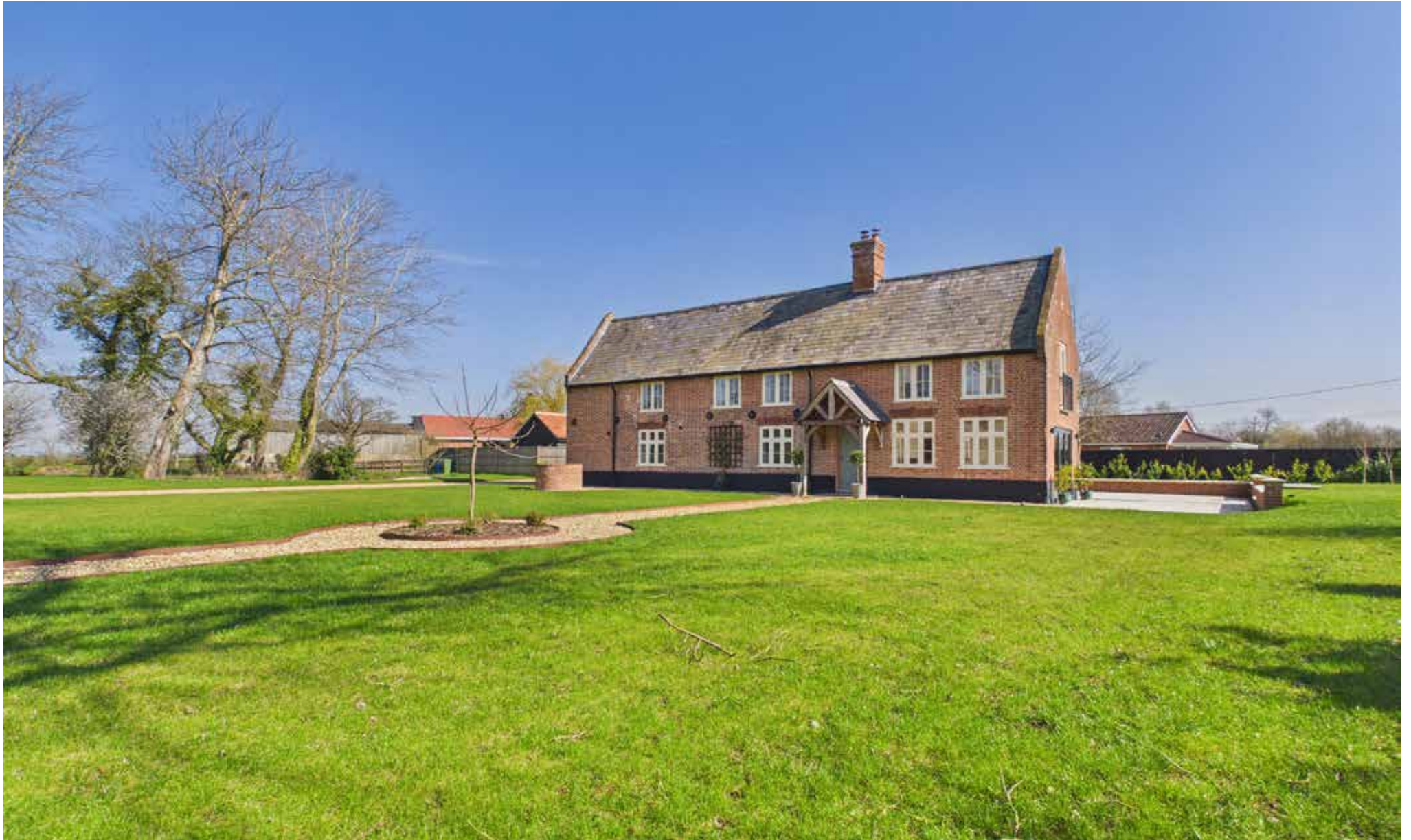
Tithe Farm House Mill Lane | Ilketshall St. Andrew | Suffolk | NR34 8JL