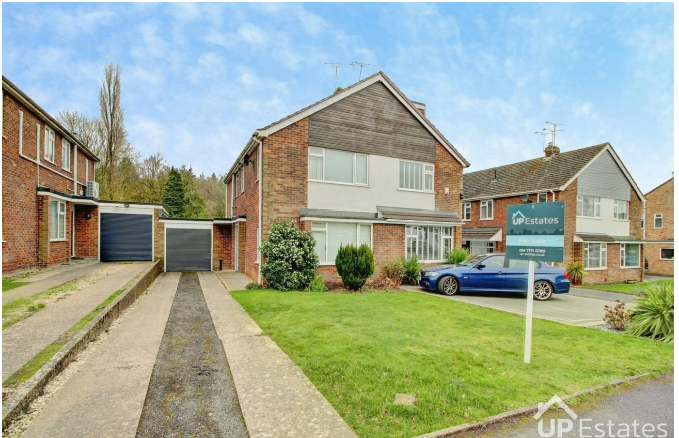
Court Leet, Coventry