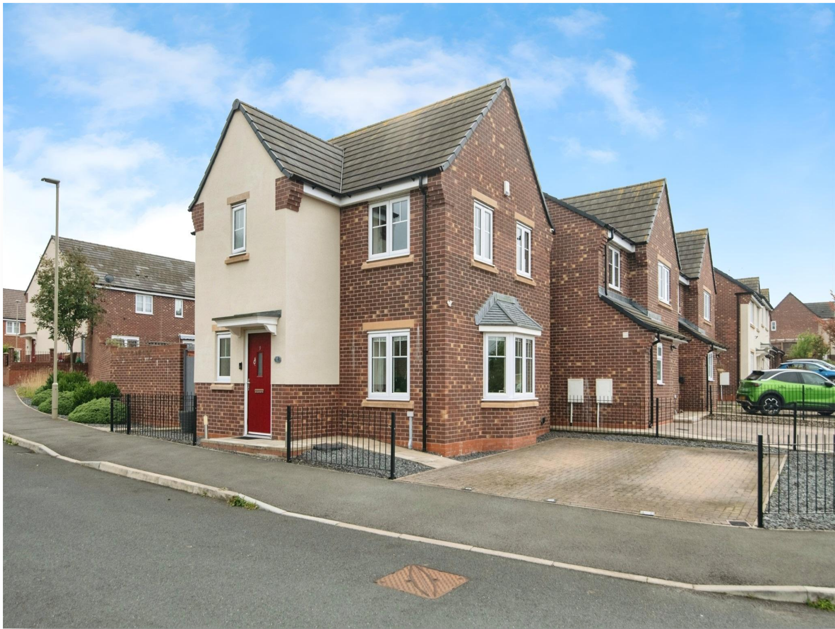
Spring Pool Meadow, Dudley DY1 2PH