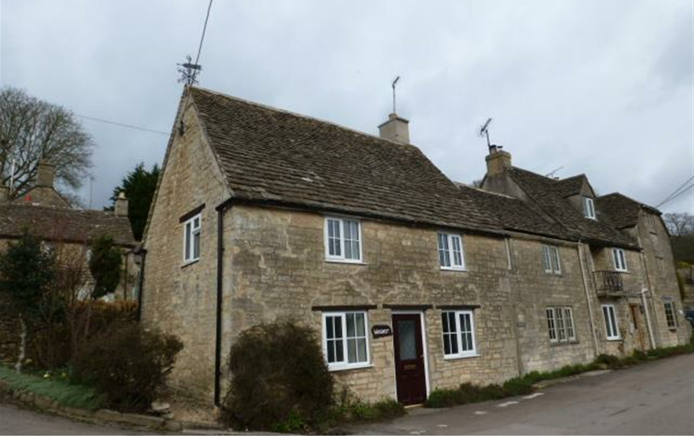
Waysmeet . . . Box, Minchinhampton