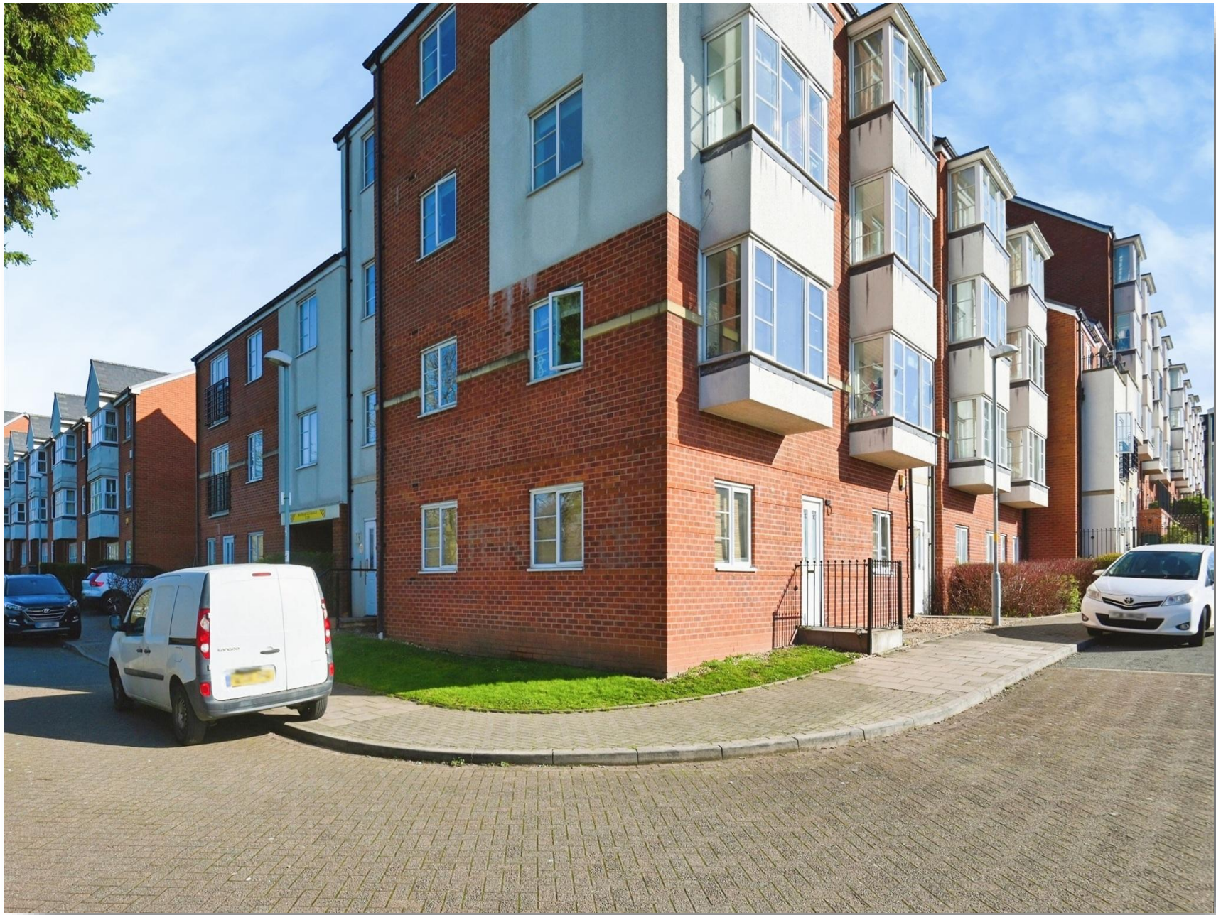
Northcroft Way, Birmingham B23 6GE