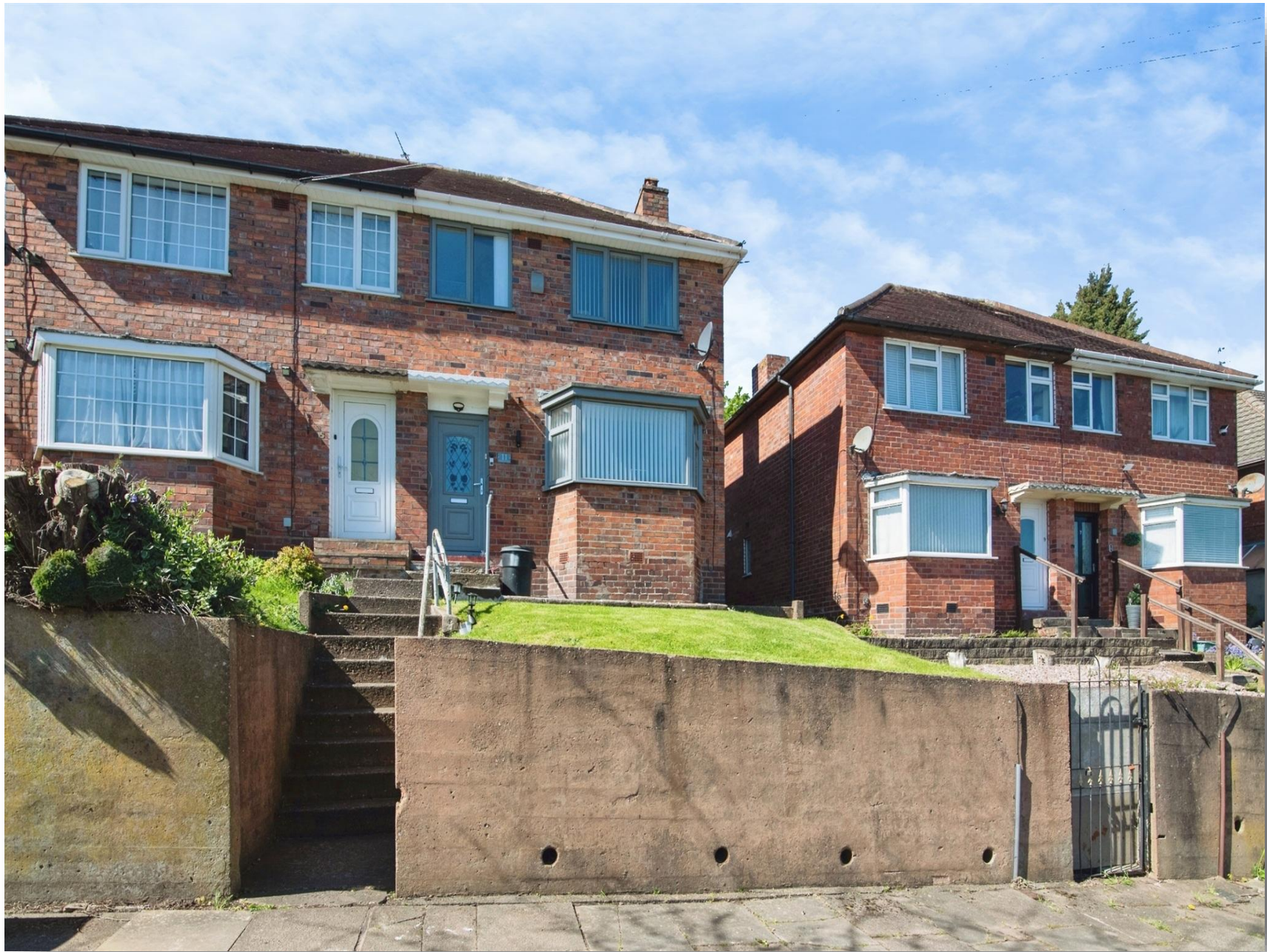
Edale Road, Birmingham B42 2DL