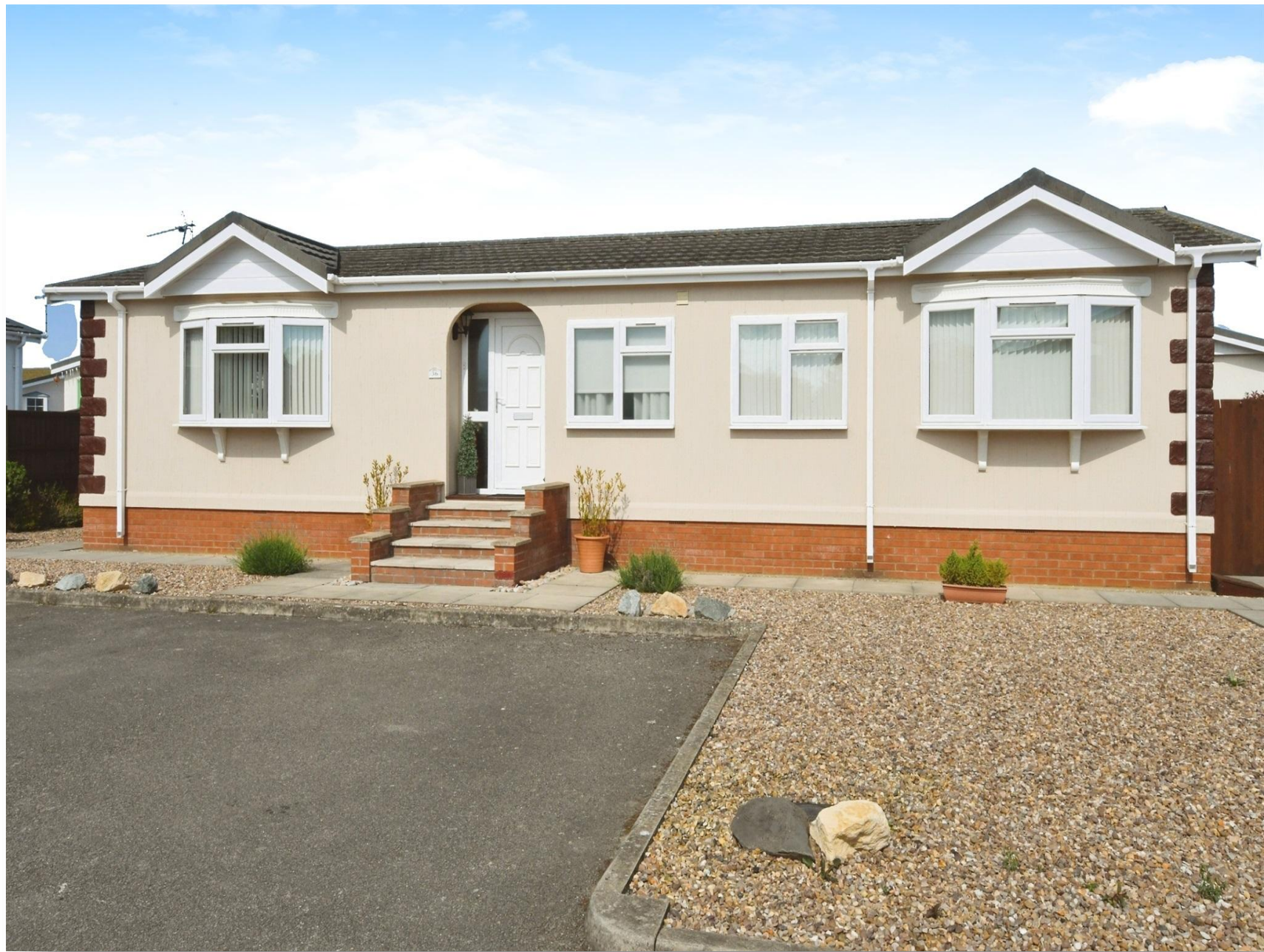
Hall Hills Park Tattershall Road, Boston PE21 9SG