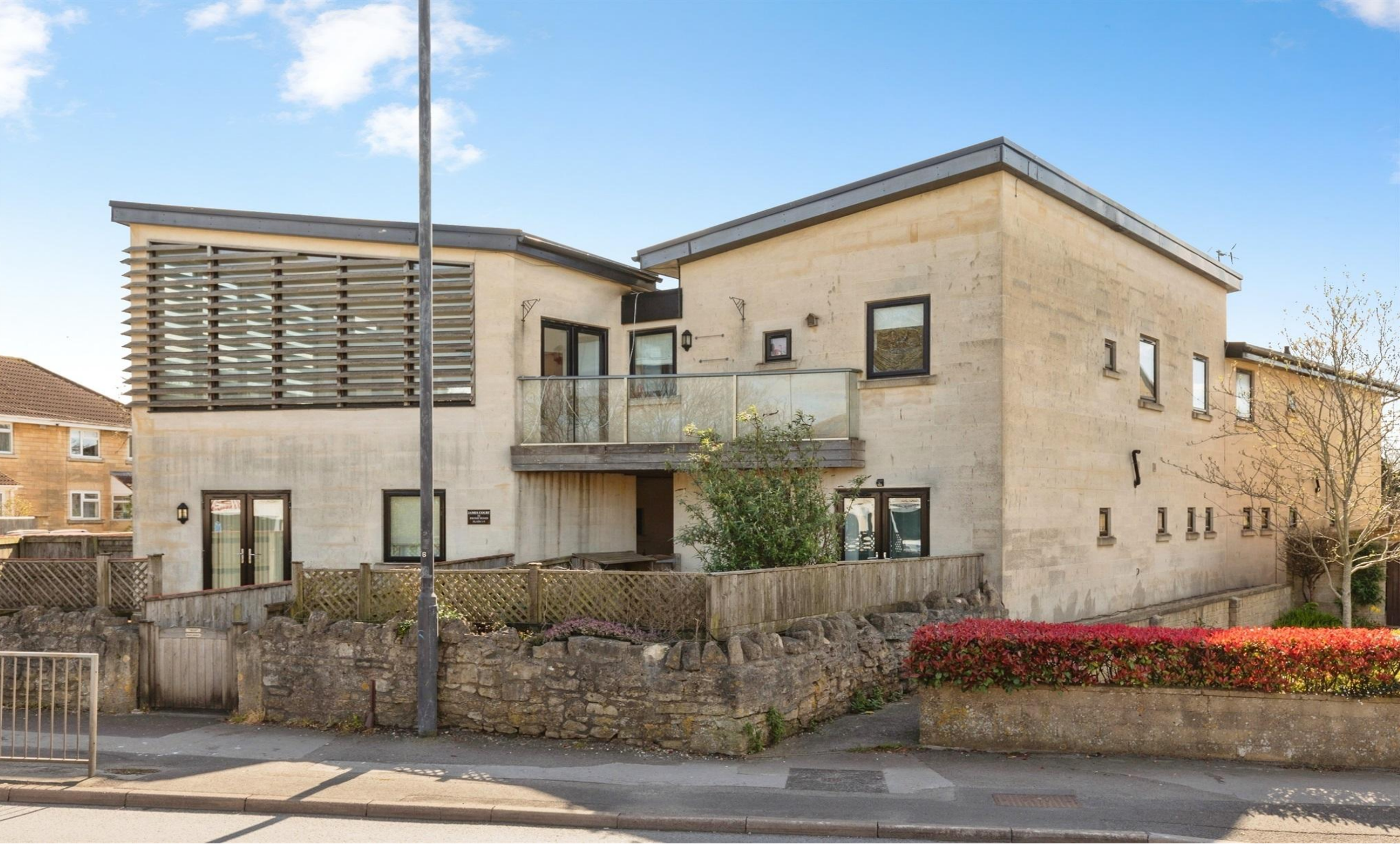
James Court Frome Road, Bath BA2 2QB