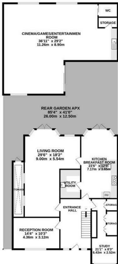
GROUND FLOOR 2207 sq.ft. (205.0 sq.m.) approx.