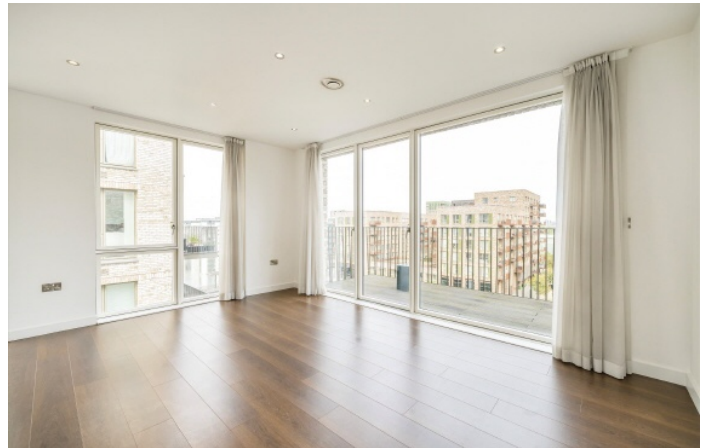
Lock Side Way, E16