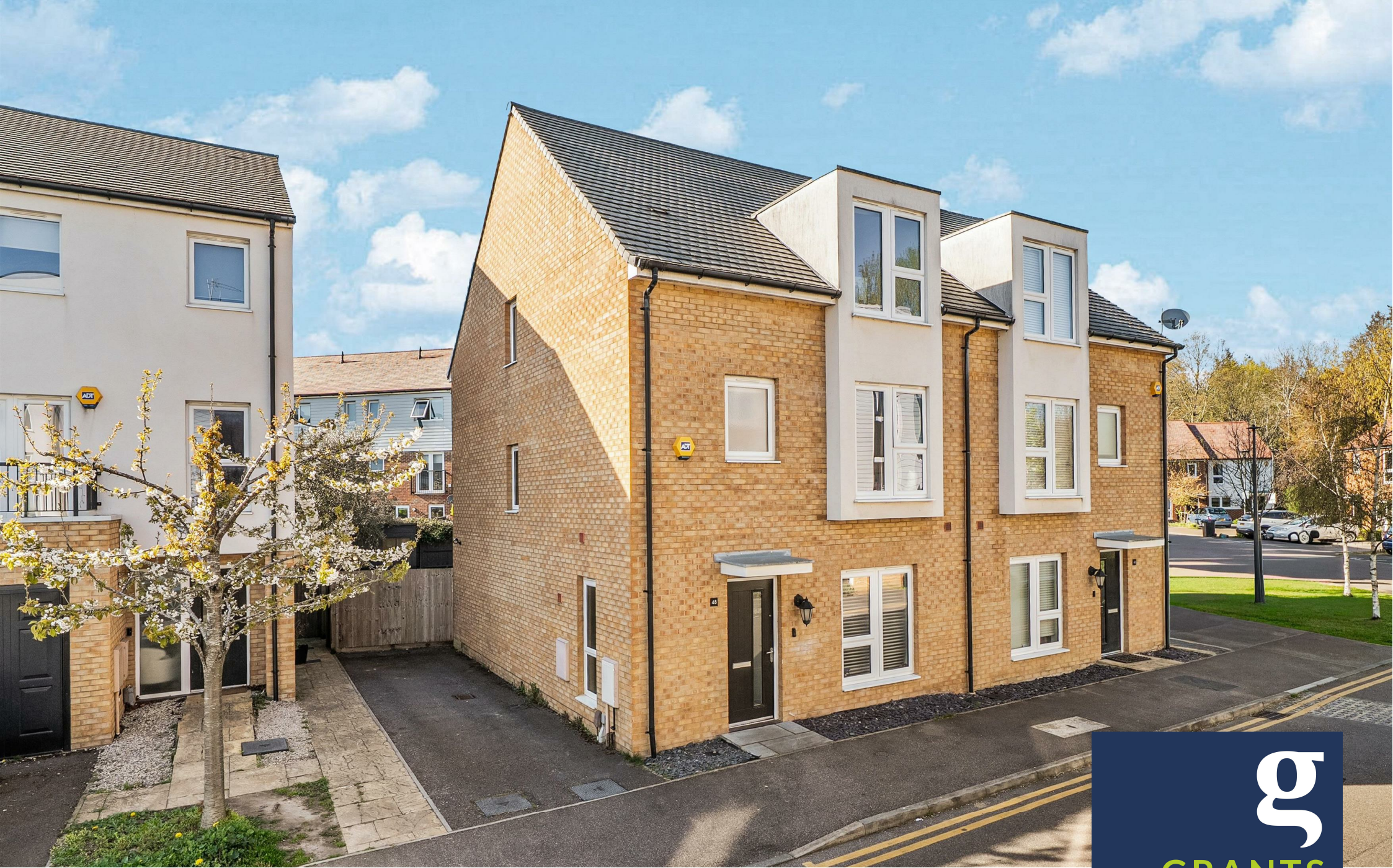
Hawker Drive, Addlestone, KT15 2FP