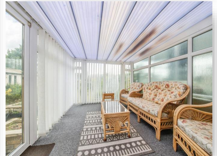
Holcombe Crescent, Ipswich, IP2 9QJ