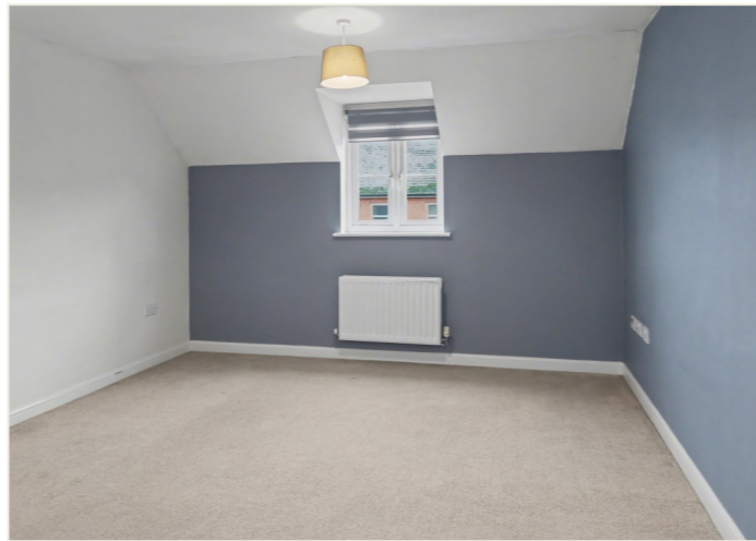
Two bedroom second floor apartment

Entrance hallway | Utility cupboard | Open-plan kitchen/ dining/living room | Two double bedrooms | Bathroom | Allocated parking | Gated development | Communal gardens