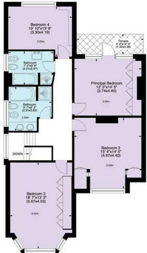
First Floor - Approx 103 Sq m - 1105 Sq ft