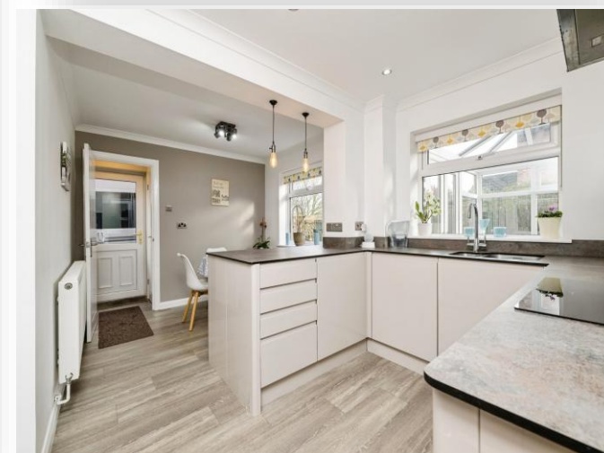
Coppins Close, Sawtry Huntingdon PE28 5UB