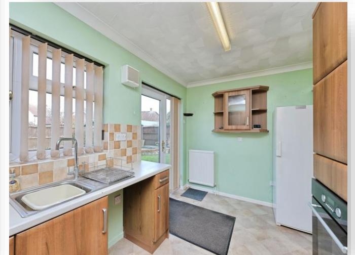
Wick Farm Close, Watton Thetford IP25 6BN