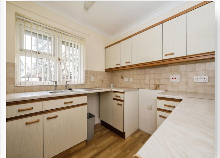
Campbell Mews, Pine Drive, Southampton SO18 5RP