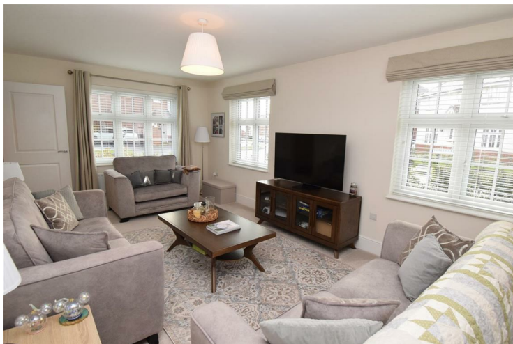
Lounge 21'0" x 11'7" (6.41 x 3.55)

Dual aspect sitting room with two radiators, an air conditioning unit, double glazed front and side windows.