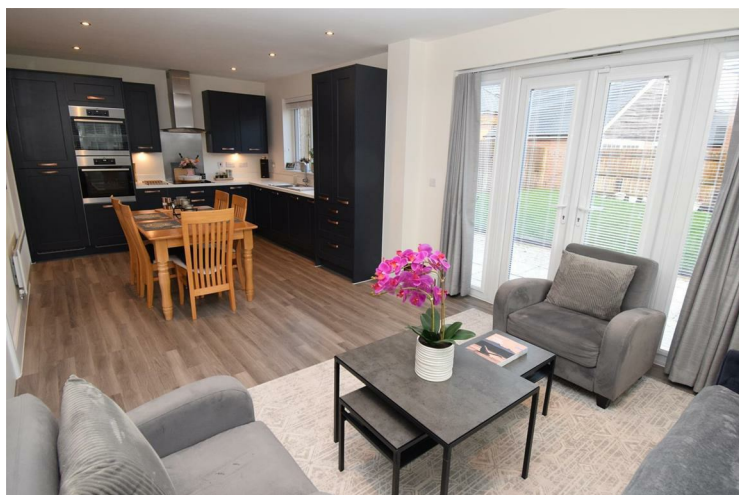
Kitchen/Diner 25'4" x 11'5" (7.74 x 3.50)

Fitted with a stunning range of base and wall units; with worktops and an inset one and a quarter sink and drainer with a mixer tap. There is a built in double electric oven, induction hob and hood; along with an integrated dishwasher, fridge and freezer. Two radiators, ceiling spotlights, double glazed front and side windows, French doors opening onto the garden and a door to the utility room.