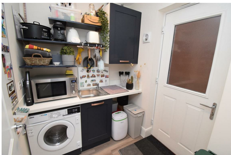
Utility Room 6'5" x 5'8" (1.96 x 1.75)

Fitted worktop with an inset sink and drainer. Space for a washing machine and tumble dryer; boiler cupboard housing the wall mounted gas boiler, a radiator, ceiling spotlights, an extractor vent and double glazed door to the rear elevation.