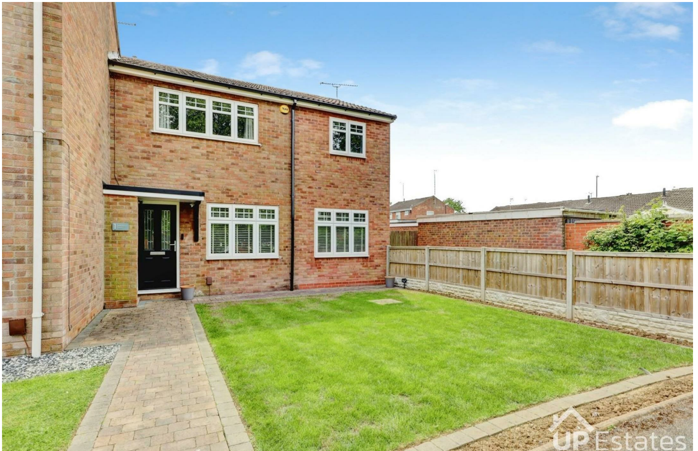
Abbotsbury Close, Coventry